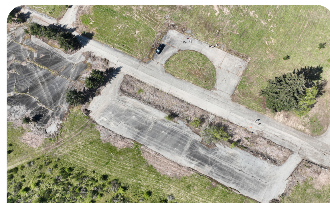
FORMER INDIAN HOSPITAL SITE

Located at the base of te'tuxwtun and adjacent to Vancouver Island University, this site has a very layered history. It was a traditional hunting and gathering ground for Snuneymuxw, then used for coal mining and agriculture by the Western Fuel Co. before being transformed into Nanaimo Military Camp. Later, Nanaimo Indian Hospital was established here. The site overlooks the city and the ocean and has a varying degree of slope. The upper parcel has a steep slope and dense forests, while the lower parcel is a mix of open spaces and forested areas.