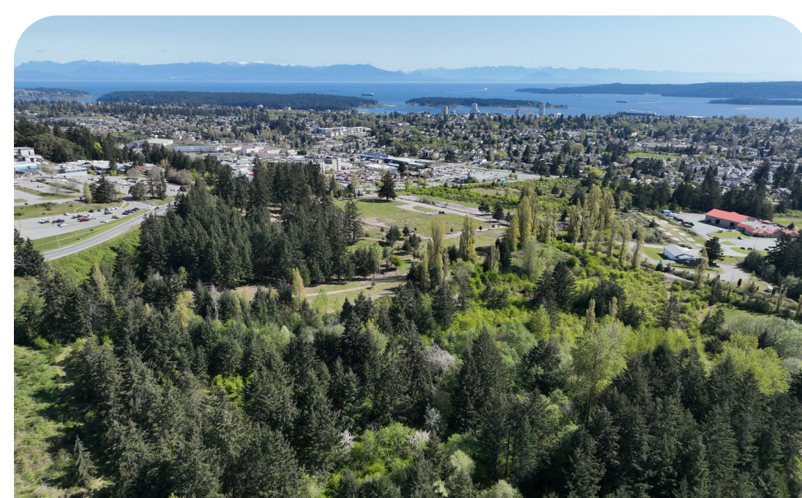
NORTHEAST VIEW FROM PARKWAY