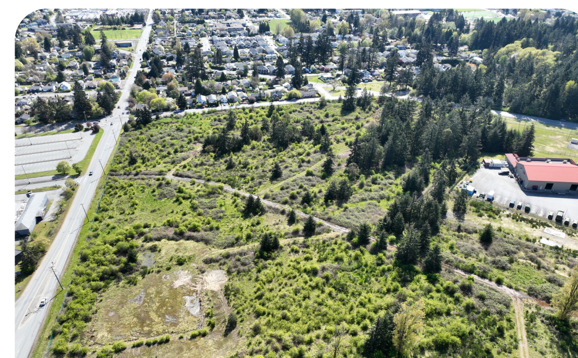
FIFTH AND WAKESIAH