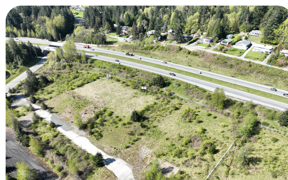
TOP OF LOWER PARCEL