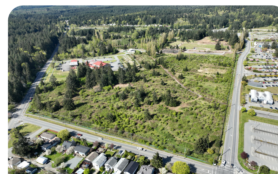
LOOKING WEST TOWARDS PARKWAY