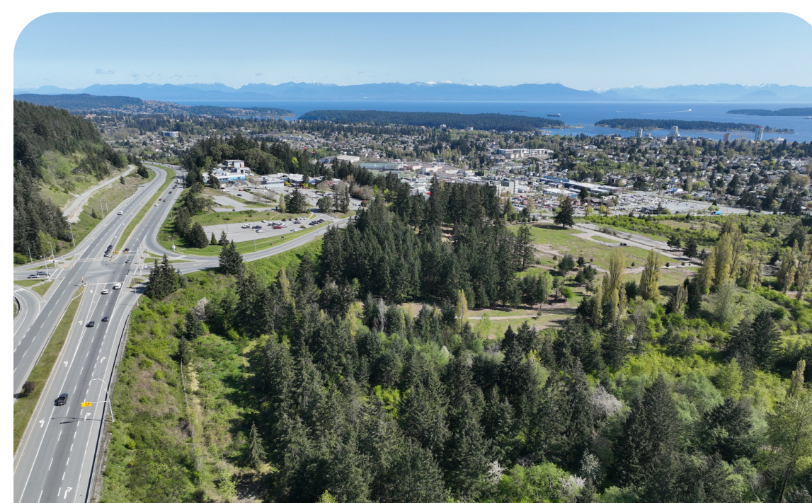
NORTH VIEW ALONG PARKWAY