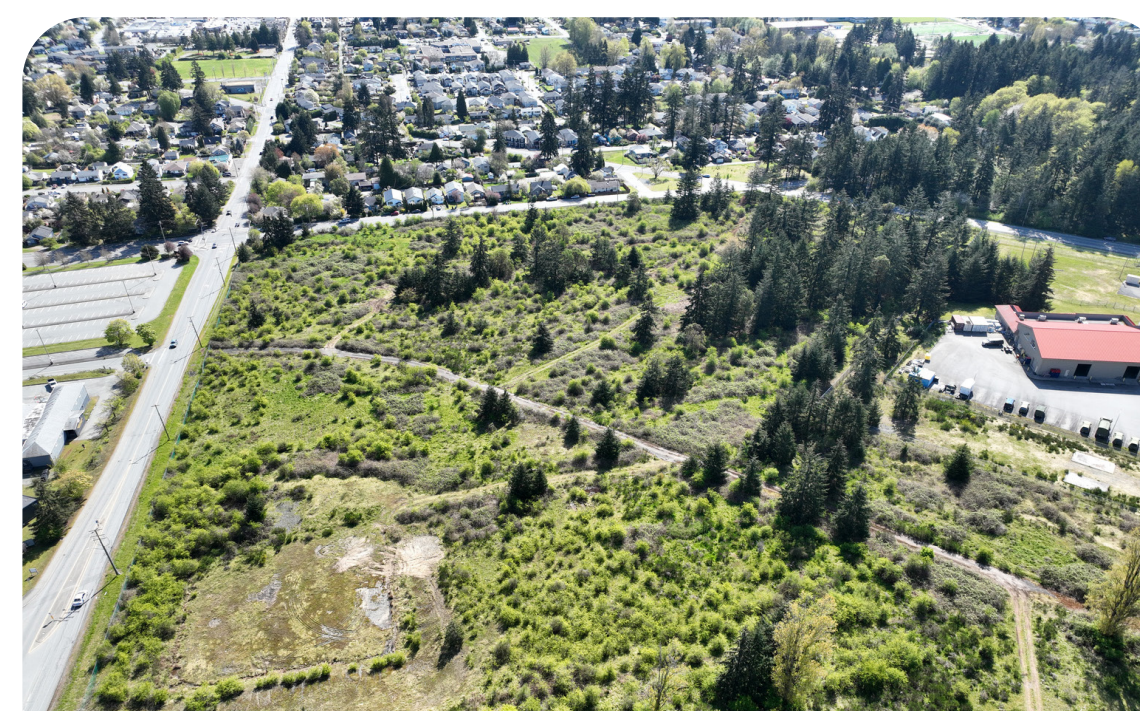
FIFTH AND WAKESIAH